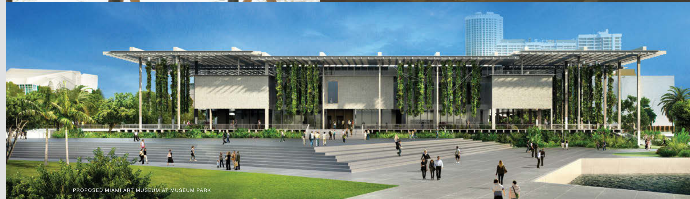
PROPOSED MIAMI ART MUSEUM AT MUSEUM PARK