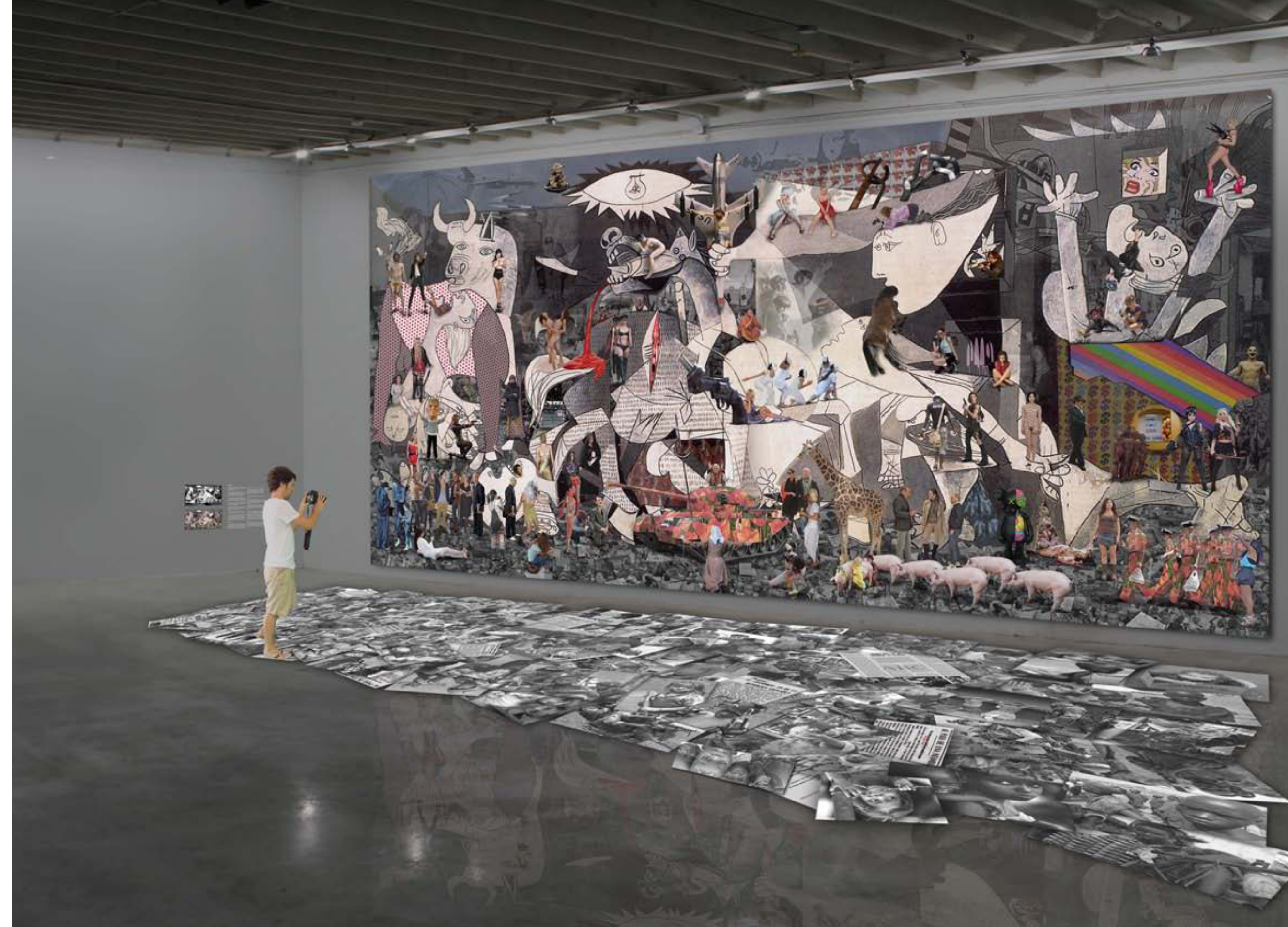
Lluís Barba Viajeros en el tiempo. Guernica. Picasso. (Artist projection) Dimensions variable

Lluís Barba's work playfully appropriates masterpieces from the history of art and reworks them using references taken from pop culture. By introducing contemporary figures into iconic compositions by artists such as Pablo Picasso, Hieronymus Bosch or Pieter Brueghel, Barba leverages the language of artistic symbolism to critique both modern society and the art world. Born in Spain, Lluís Barba has exhibited his work in the United States, Europe, Latin America and Canada. His work is held in major public collections, such as the Artothèque d'Art Anekdotia in Paris, Museo Internacional Cairo, Museo Marugame Hirai Japan and more. He currently lives and works in Barcelona.