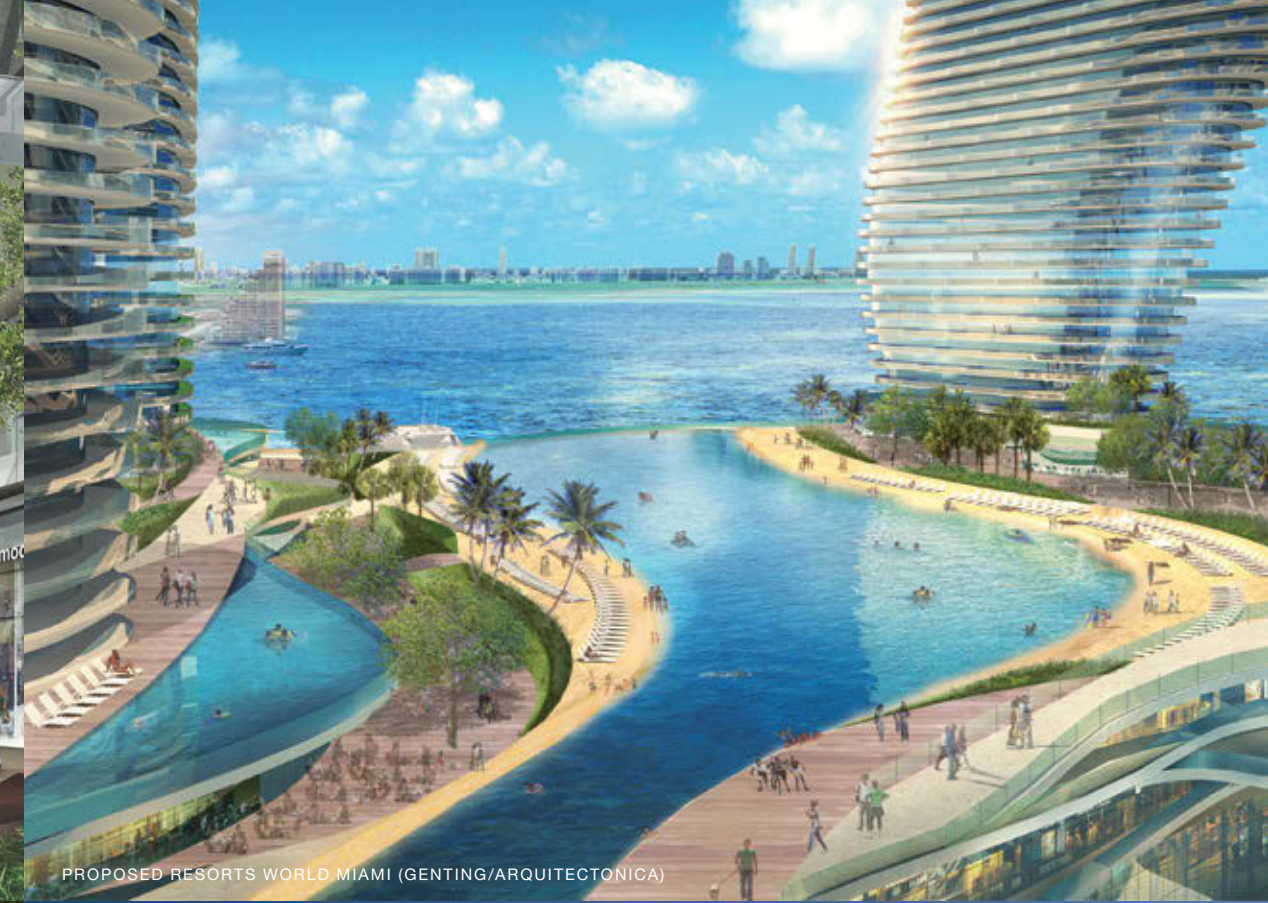
PROPOSED RESORTS WORLD MIAMI (GENTING/ARQUITECTONICA)